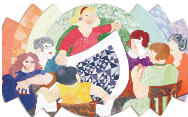
'Daphne's Show and Tell'